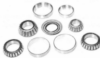
Factory or National Seal Timken Bearings

Additional Information To 1996 Pinion Seal #3896 97 and Later Pinion Seal #26064029 Front Pinion Bearing #88649 / Race #88610 Rear Pinion Bearing #804846 / Race #804810 Side Bearings #JLM506849A / Races #JLM506811 Axle Seal #3747 Axle Bearing #R1561TV